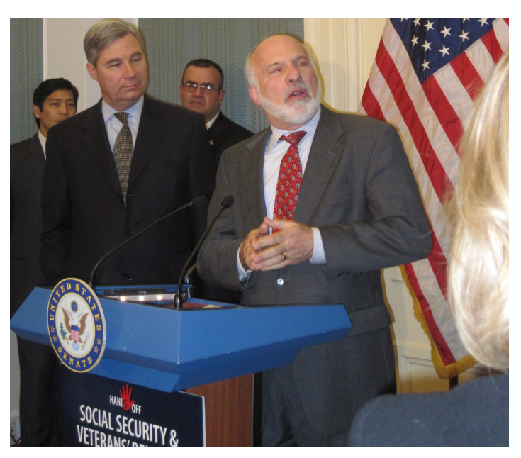
The Arc's CEO, Peter V. Berns, speaks at a Capitol Hill press conference on the chained CPI in January, 2013. At left is U.S. Senator Sheldon Whitehouse from Rhode Island.

NASI asked survey respondents to consider 12 possible policy packages to strengthen Social Security. The packages had different combinations of cutting or increasing benefits and reducing or increasing Social Security's dedicated funding. The most favored package – supported by over 7 in 10 respondents – would actually increase the Social Security COLA so that it better reflects beneficiaries' daily living expenses.