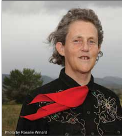
Dr. Temple Grandin