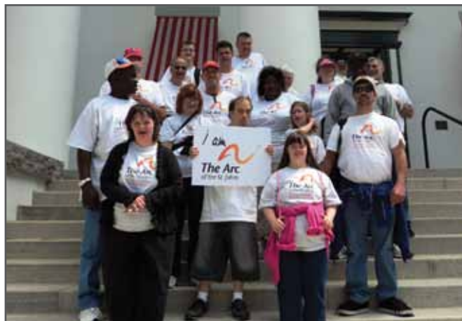
Supporters of The Arc of the St. Johns at the Governor's office in Tallahassee, FL